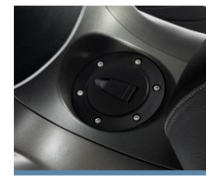
PRACTICAL FUEL CAP POSITIONED IN THE TUNNEL