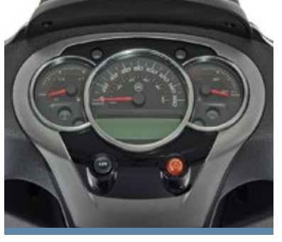
ELEGANT DASHBOARD WITH MODERN LCD DISPLAY