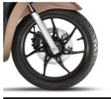
BLACK DIAMOND WHEEL RIMS

The "S" version expresses all the energy of your personality and dynamism of your daily life. Details that set the style tone: the saddle with exclusive finishes, the diamond-edged wheel rims and the black rear view mirrors. The 50 cc is joined by the 125 and 150 cc engine capacities with ABS only on the front wheel with a Marrone Terra, Bianco Luna, Grigio Materia or Nero Meteora livery so that you can stand out with a touch of style.