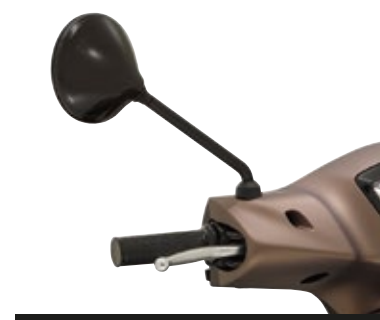
BLACK REAR VIEW MIRRORS