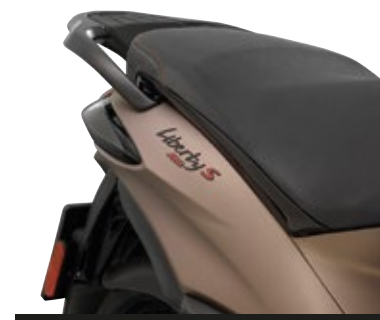
BLACK REAR GRAB HANDLE