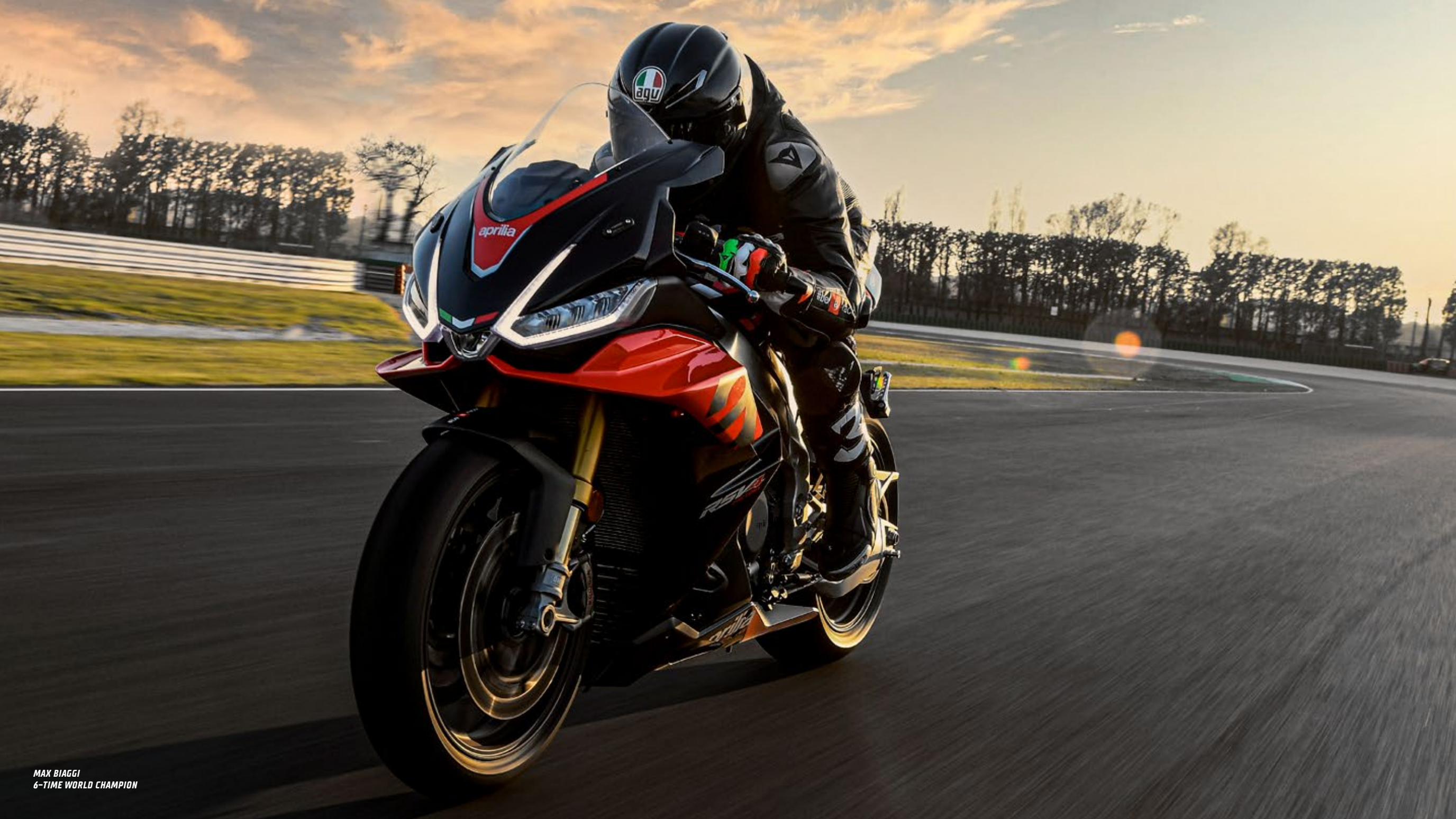
MAX BIAGGI 6-TIME WORLD CHAMPION