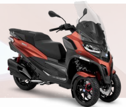
ARANCIO SUNSET MATT