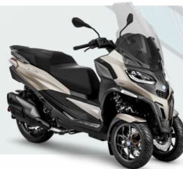
GRIGIO CLOUD MATT