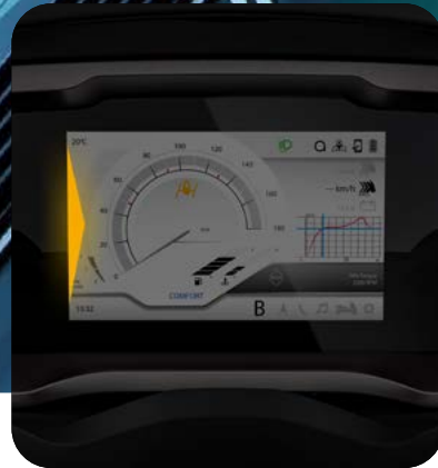
BLIND SPOT INFORMATION SYSTEM