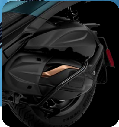
NEW 530 CC EURO 5 ENGINE