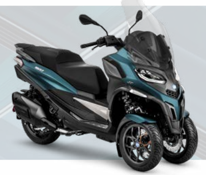
BLU OXYGEN MATT