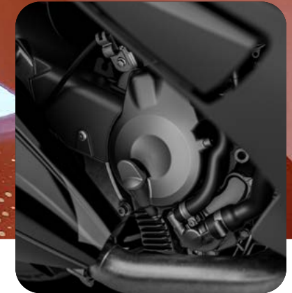
400 CC EURO 5 ENGINE