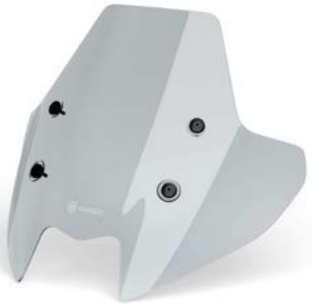
BLACK SPORT FLYSCREEN