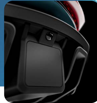
REVERSE DRIVING WITH REAR CAMERA