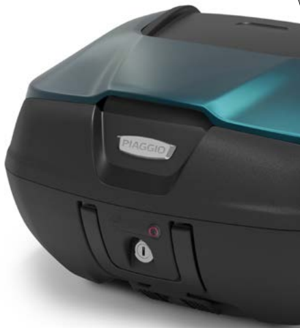
TOP BOX 52 l