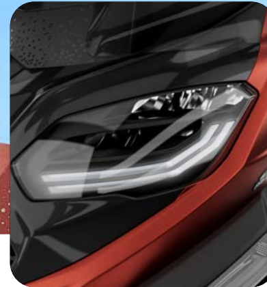
NEW LED DRL HEADLIGHTS