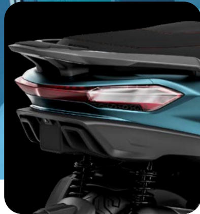
NEW DESIGN WITH ULTRAMODERN DESIGNS