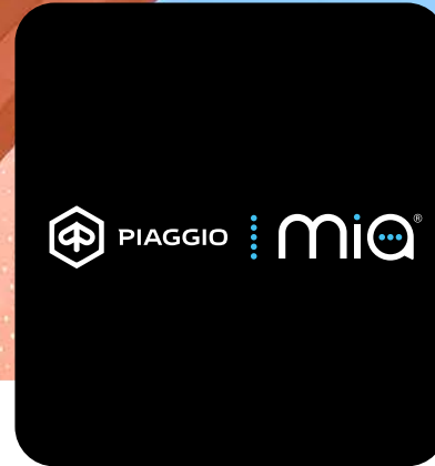
ADVANCED CONNECTIVITY WITH PIAGGIO MIA ON BOARD